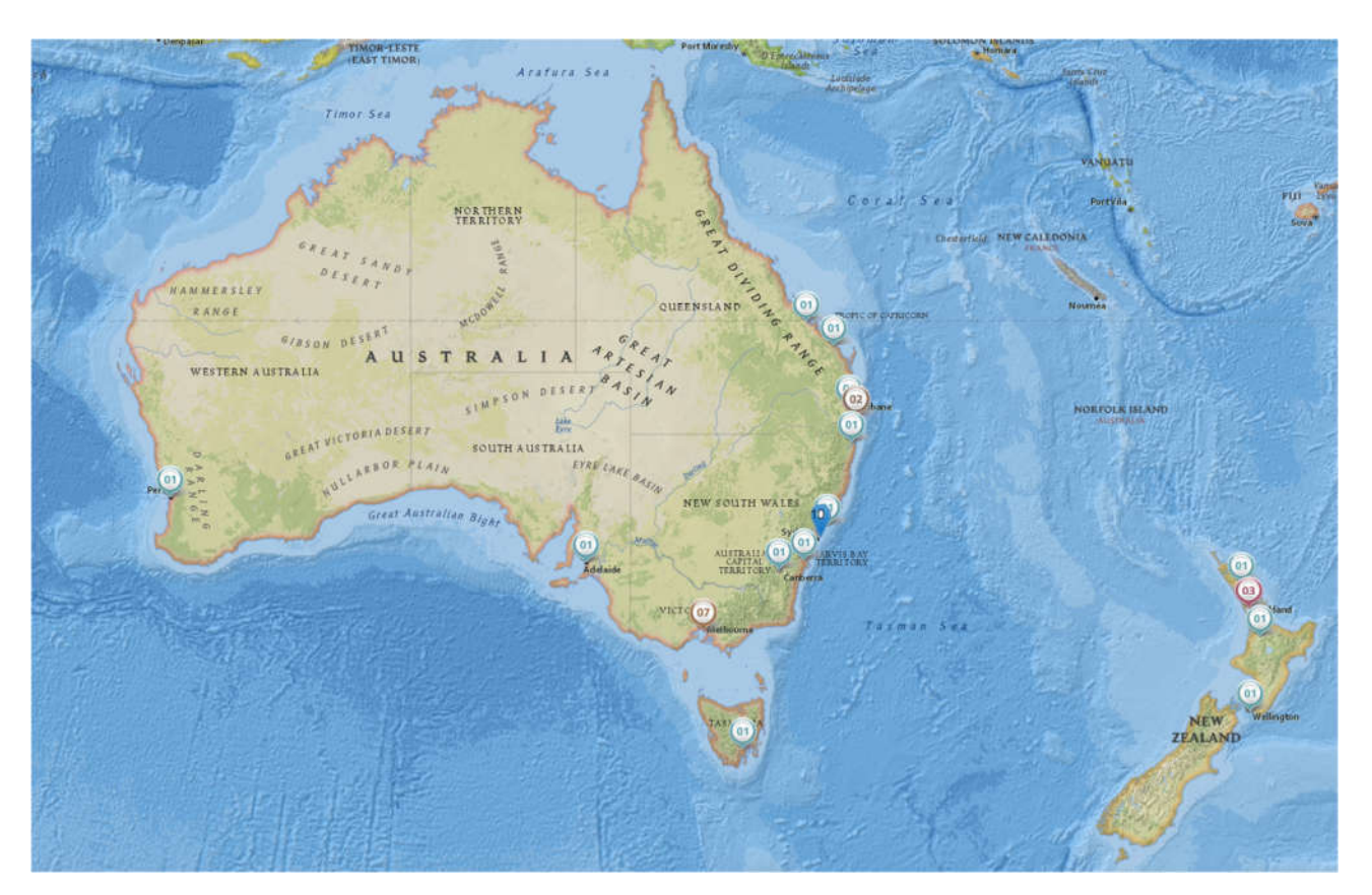
Figure 2 - Citizen Distribution across the province

The heaviest distribution of citizens is based in the Sydney NSW region. These are all known inactive citizens. Melbourne has the second largest distribution of citizens in the province.