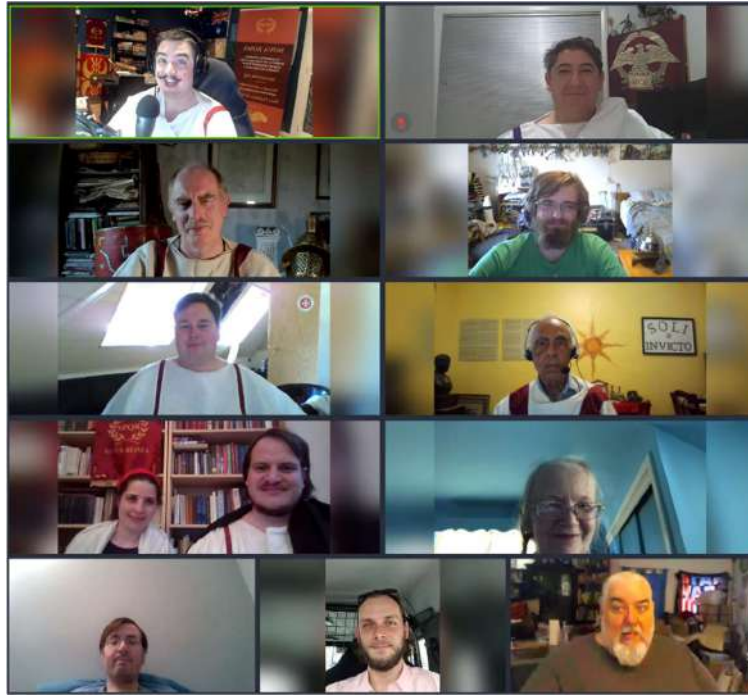
Figure 1 - Nova Roma World Meeting - June 2774