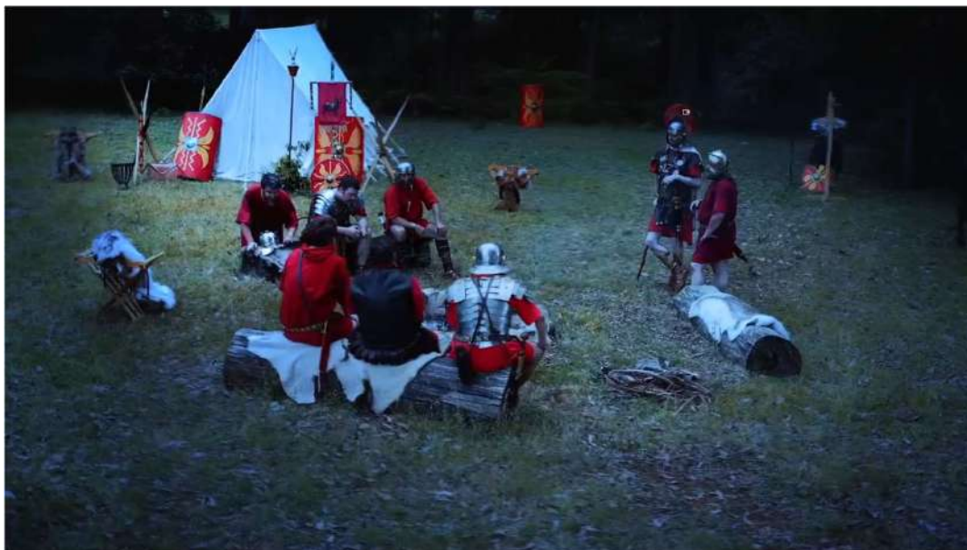
Figure 2 - Nova Roma citizens imbedded with Allied Legion, Legio X Fretensis (Ancient Roman Reenactors Victoria) - January 2774