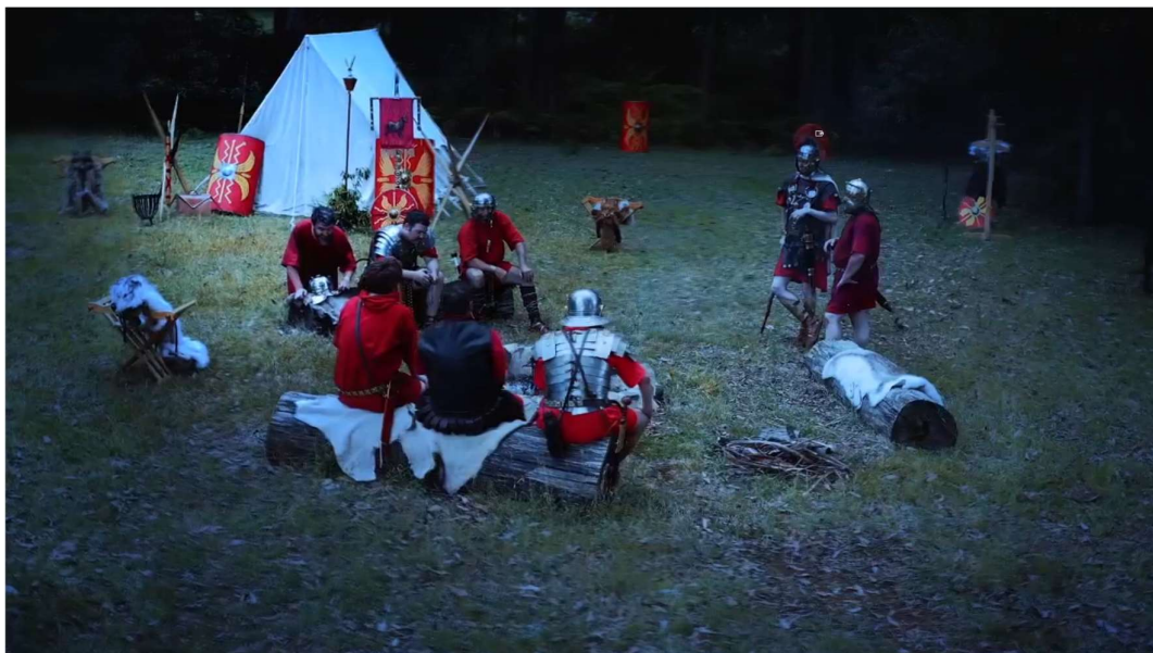
Figure 2 - Nova Roma citizens imbedded with Allied Legion, Legio X Fretensis (Ancient Roman Reenactors Victoria) - January 2774