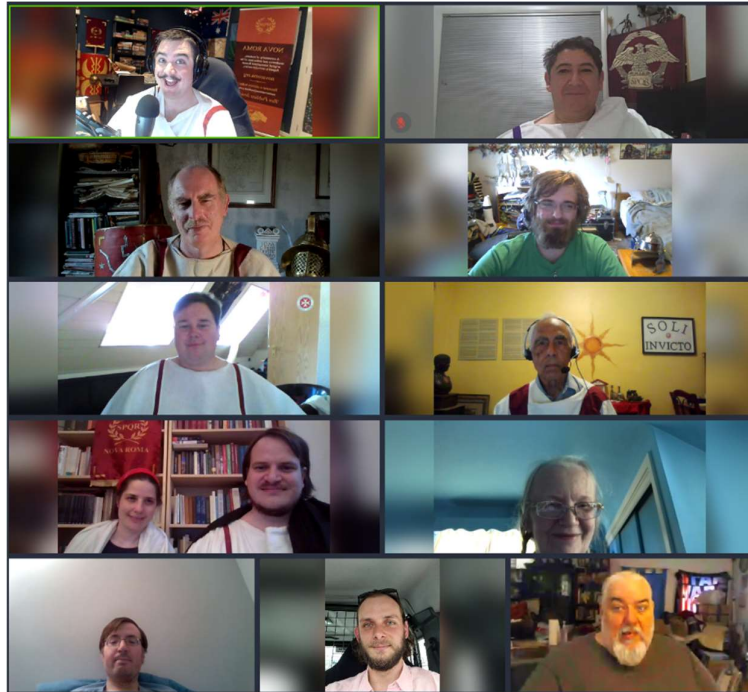
Figure 1 - Nova Roma World Meeting - June 2774